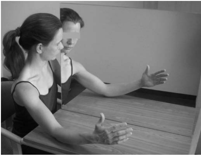
Figure 1 Setup for Mirror Therapy

Note: The patient's affected arm is hidden behind the mirror. While she is moving her unaffected arm, she is watching its mirror image as if it were the affected one.